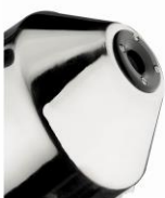
Nozzle Assembly Non Rotating Vortex Design Engg. Plastic