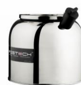
Liquid Tank Stainless Steel 304 Grade. with 6 Ltrs Tank Capacity