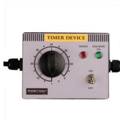
Mechanical Timer 1 to 60 minutes