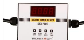
DIGI-PLUS Digital Timer 1 to 99 minutes with total runtime counter