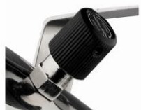
Flow Control Adjustable Flow Control Knob